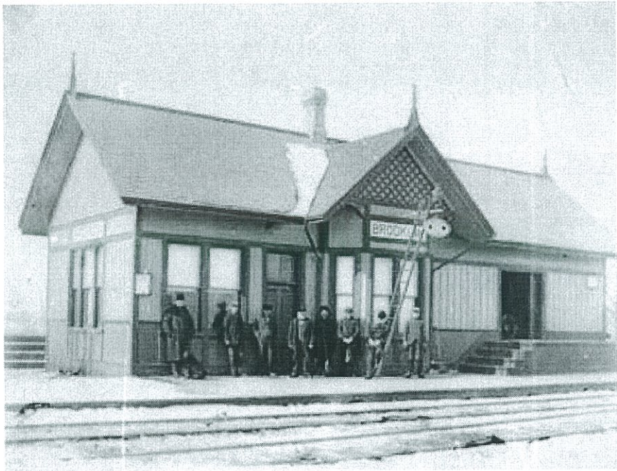
Men stand outside the Brooklin station on the PW&PP, c.