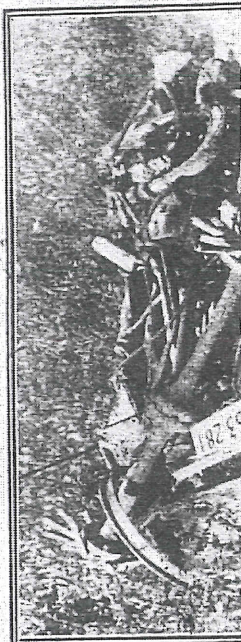
Tragic Radial-Automobile Smash Near Cooksville

Twin Sisters and Young Brothers Drown Near Kings- ton—Speedboat Collision Takes Two Lives— Prominent Toronto Military Man Dies Attempting Rescue—Long List of Highway Collisions Brings