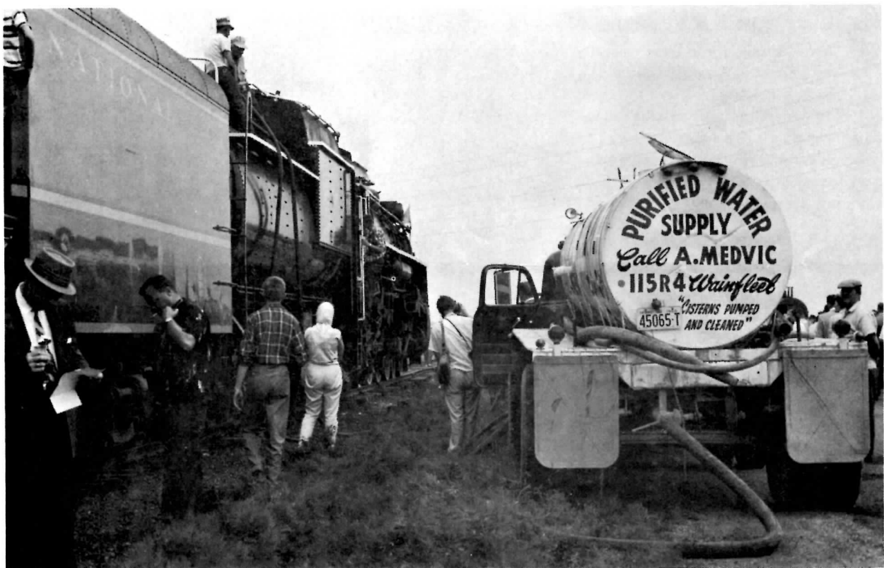
Nothing but the best! A view of the "watering up" arrangement at Port Colborne.