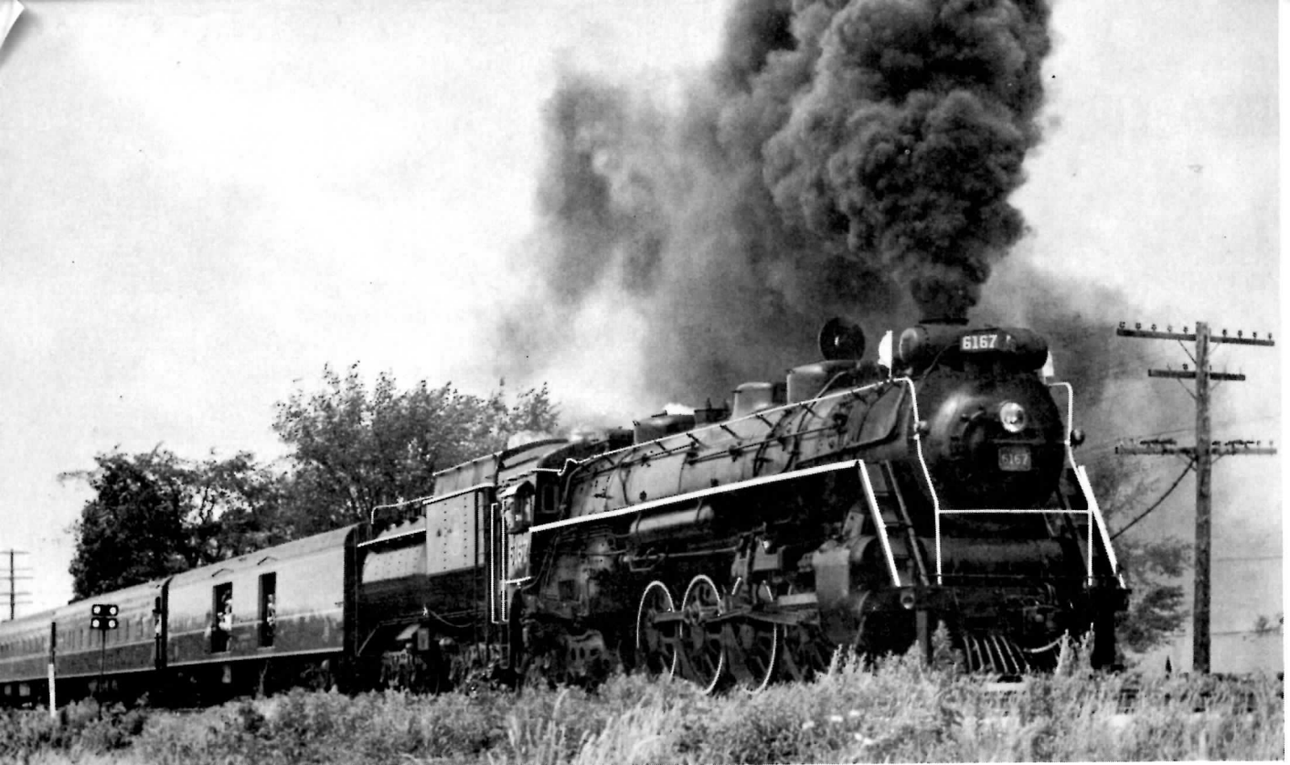
Another action shot of 6167, crossing the Michigan Central and the Wabash at Canfield Jct.