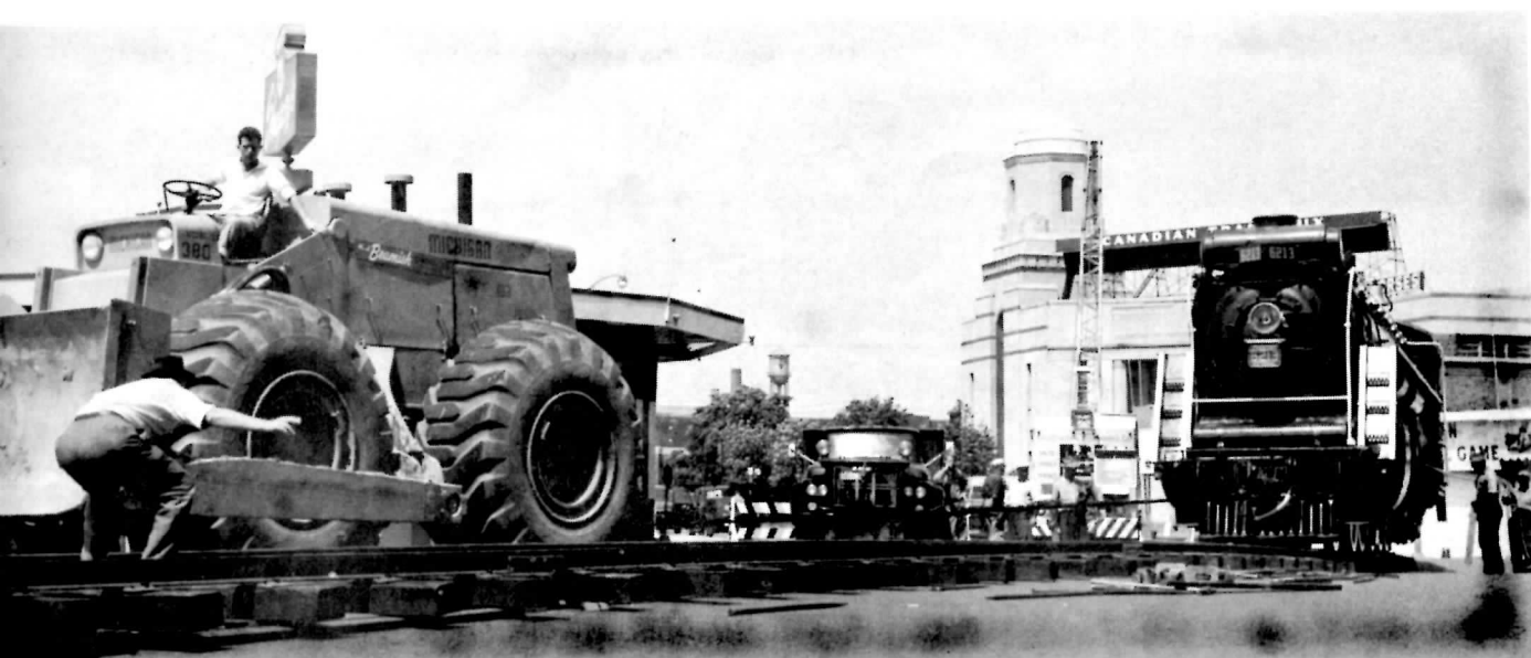
"Michigan" Earth Mover eases the engine over temporary rails.