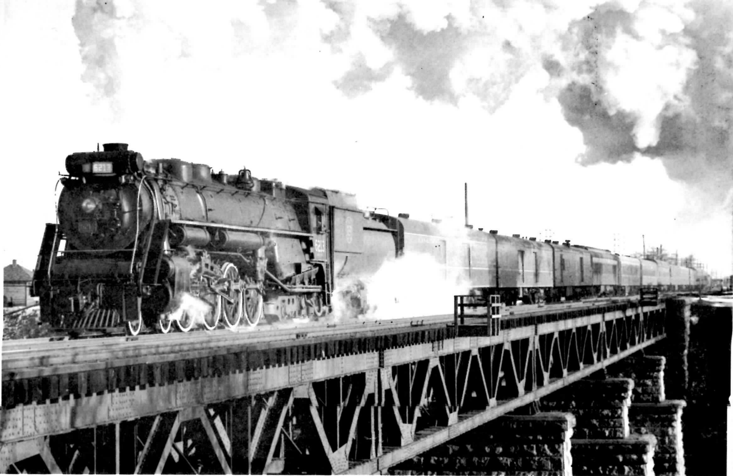
Near the end of her career, 6213 hauls Train 101 across Sixteen Mile Creek at Oakville, Ont., Jan. 31, 1959.