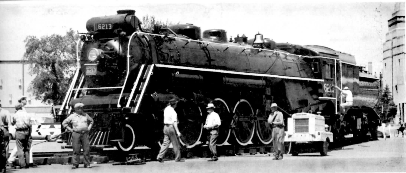
Between the Food Building and the Grandstand. Note air compressor connected to 6213's air reservoir.