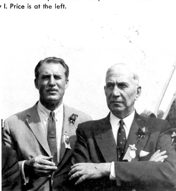
The Hon. George Hees, Minister of Transport, who also took part in the ceremony, is shown with Mr. Price.